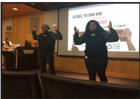
8 - Palomar hosts event to raise HIV awareness.