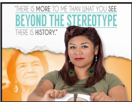
12 - Beyond the Stereotype campaign challenges cultural appropriation.