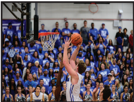
4 - Men's basketball aims for a successful season.