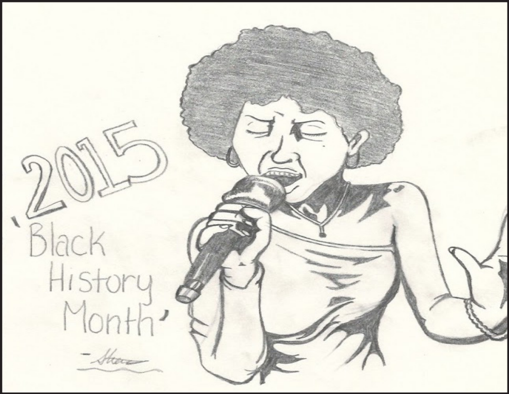
Graphic drawn by Shakara Thompson.

of visible punishment for those who abuse that power that leave us afraid. Inaction has been shown in history to be taken as a sign of consent in this day and age, and isn't much of a leap to believe that the absence of punishment is encouragement of this behavior. Otherwise, history would not continue to repeat itself. "If you have done nothing wrong, what do you have to hide?" remains as valid justification for many ethically, morally and legally wrong actions taken by law enforcement towards not only black individuals but all people of color. This causes us to believe this era of fear is far from over.