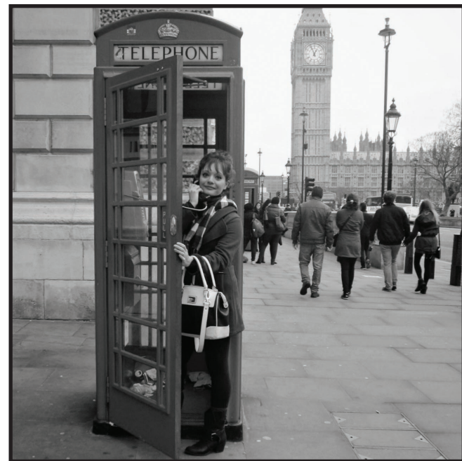
A London scene with Big Ben in the background.

I recommend travel to students in college because it not only gives you confidence but opens your eyes to how others live and view the world. Through this experience, I was able to also solidify my plans after graduation. Because of the experience, I realized that I want to teach English in Italy. Although I will have to brush up on my Italian, without traveling I never would have realized how much I was missing and I would have never fell in love with a country and a people.