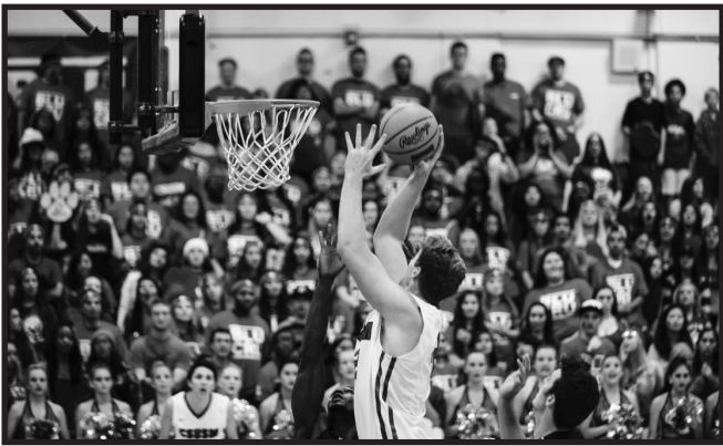
Cougar athlete goes up for a score.

higher caliber, as if we do not already have enough fire power. Second, we will finally have our own gym which will make it that much more of burden for opponents to try and withstand the debacle we place upon them when they travel to play us. It is almost safe to say that at this point, one wouldn’t think twice if he or she was told that the CSUSM Cougars played the Los Angeles Lakers and came out victorious. That is not a knock on the Lakers and how abysmal they look without Kobe Bryant, but more of a well-deserved praise towards our