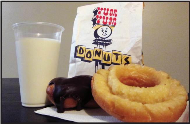
Yum Yum Donuts open all night for your late night cravings.

hesitant to believe him at first, but eventually decided to go after some convincing. After a few minutes of driving, the three of us finally arrived to our destination. There, in front of me, was a lit-up sign that said, Yum Yum Donuts, Open 24/7. Feelings of excitement and joy were overwhelming at that moment. We walked inside and began ordering. Each individual donut cost 99 cents, a half of dozen costs a little over 5 dollars, and a full dozen (includes two extra donuts) costs roughly 9 dollars. These are average prices and something I would